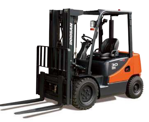
D20S / D25S / D30S / D33S-5 & D35C-5 G20E / G25E / G30E-5 G20P / G25P / G30P / G33P-5 & G35C-5 2,000kg 2,500kg 3,000kg 3,300kg 3,500kg Diesel, LP, Pneumatic Tire