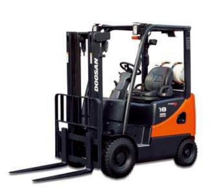
D15S / D18S-5 & D20SC-5 G15S / G18S-5 & G20SC-5 1,500kg 1,750kg 2,000kg Diesel, LP, Pneumatic Tire